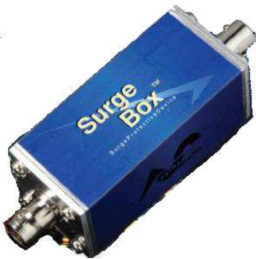
SURGEBOX COAXIAL TYPE